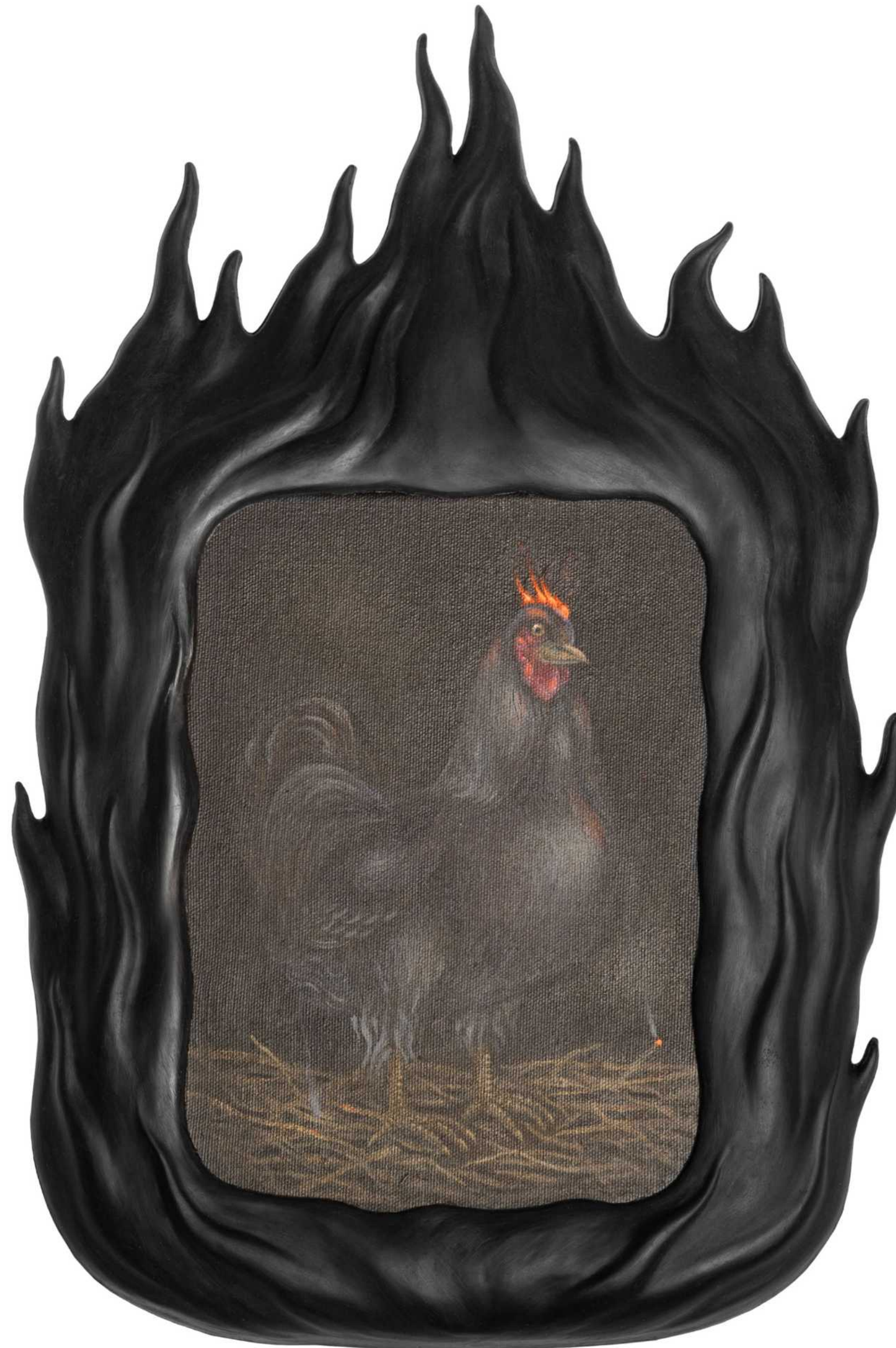
Phoenix , 2023 Acrylic on canvas, rubber 45 x 29 cm 17 3/4 x 11 3/8 in