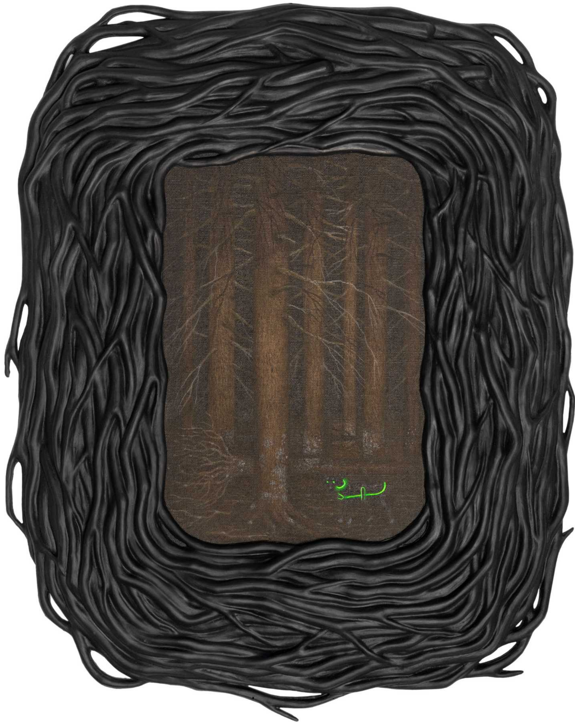
Gregoire , 2023 Acrylic on canvas, rubber 53 x 42 cm 20 7/8 x 16 1/2 in