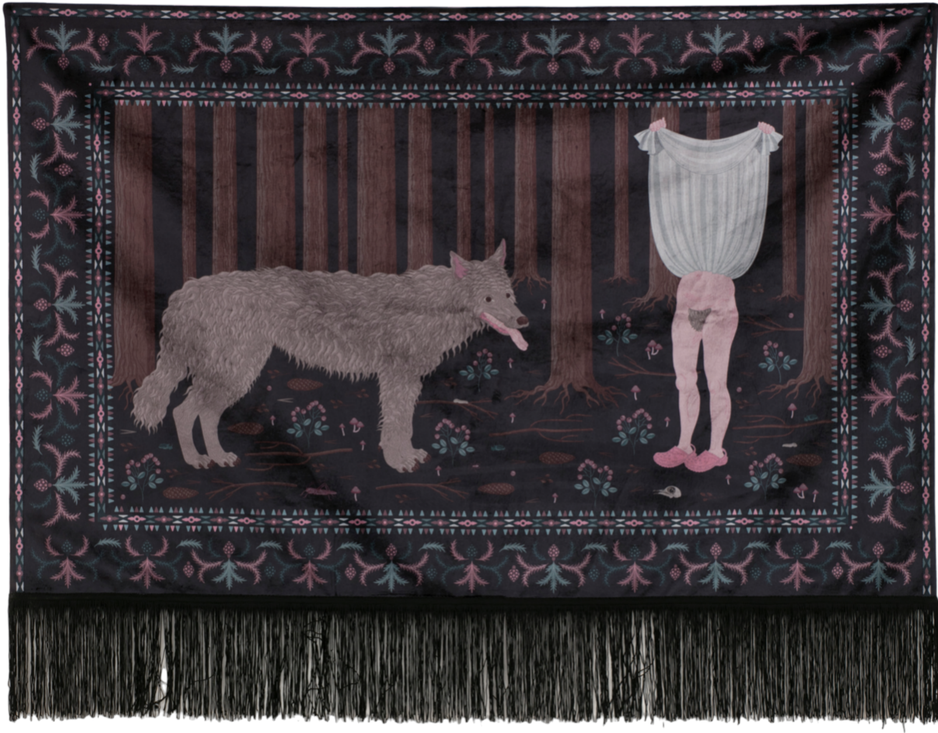
Aigars story, 2023