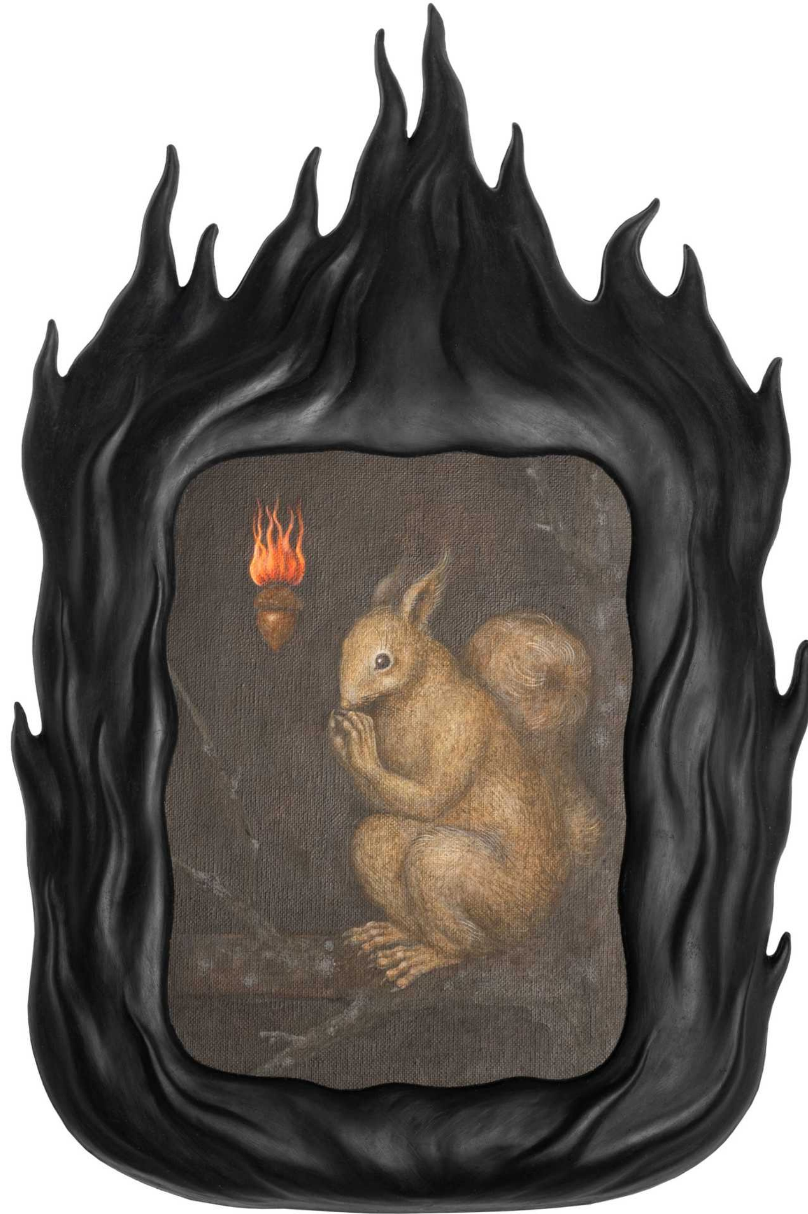
Apparition of a corn, 2023