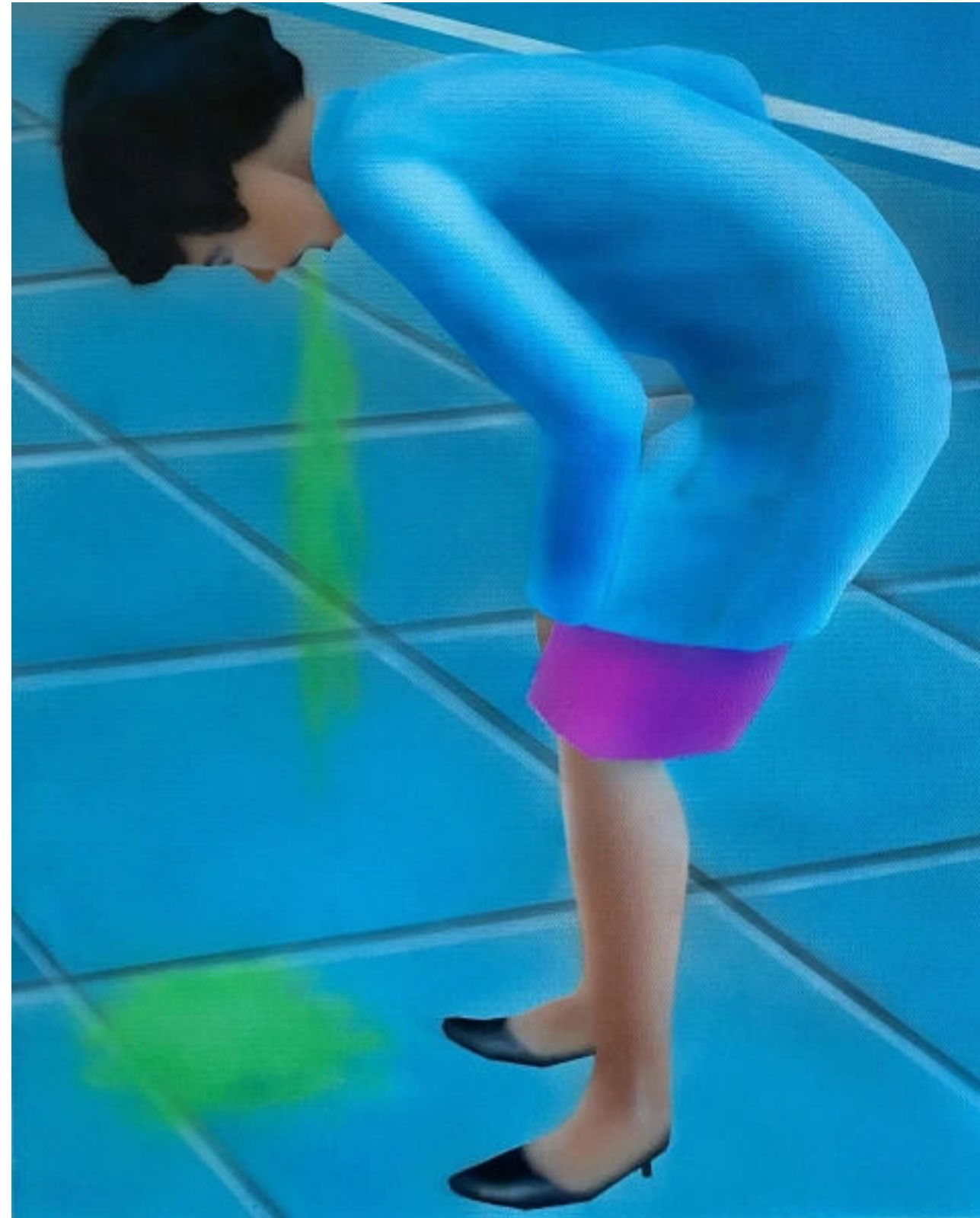
Vomit , 2022 Acrylic on canvas 50 x 70 cm