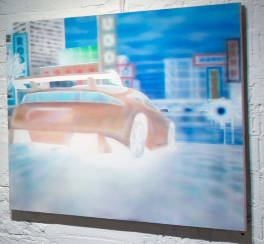
25% of Irony, 2022 Installation view