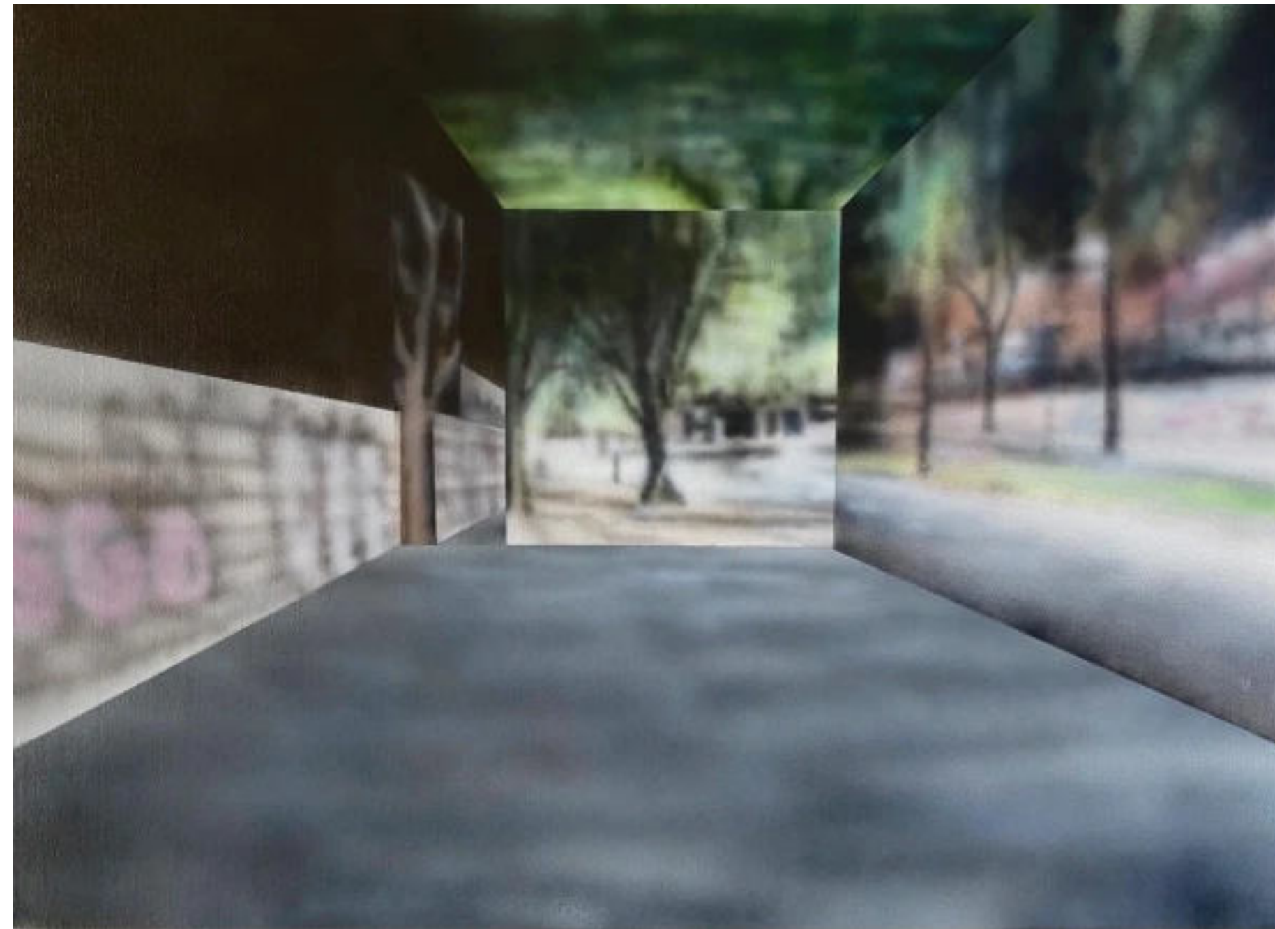
Street view 3, 2022