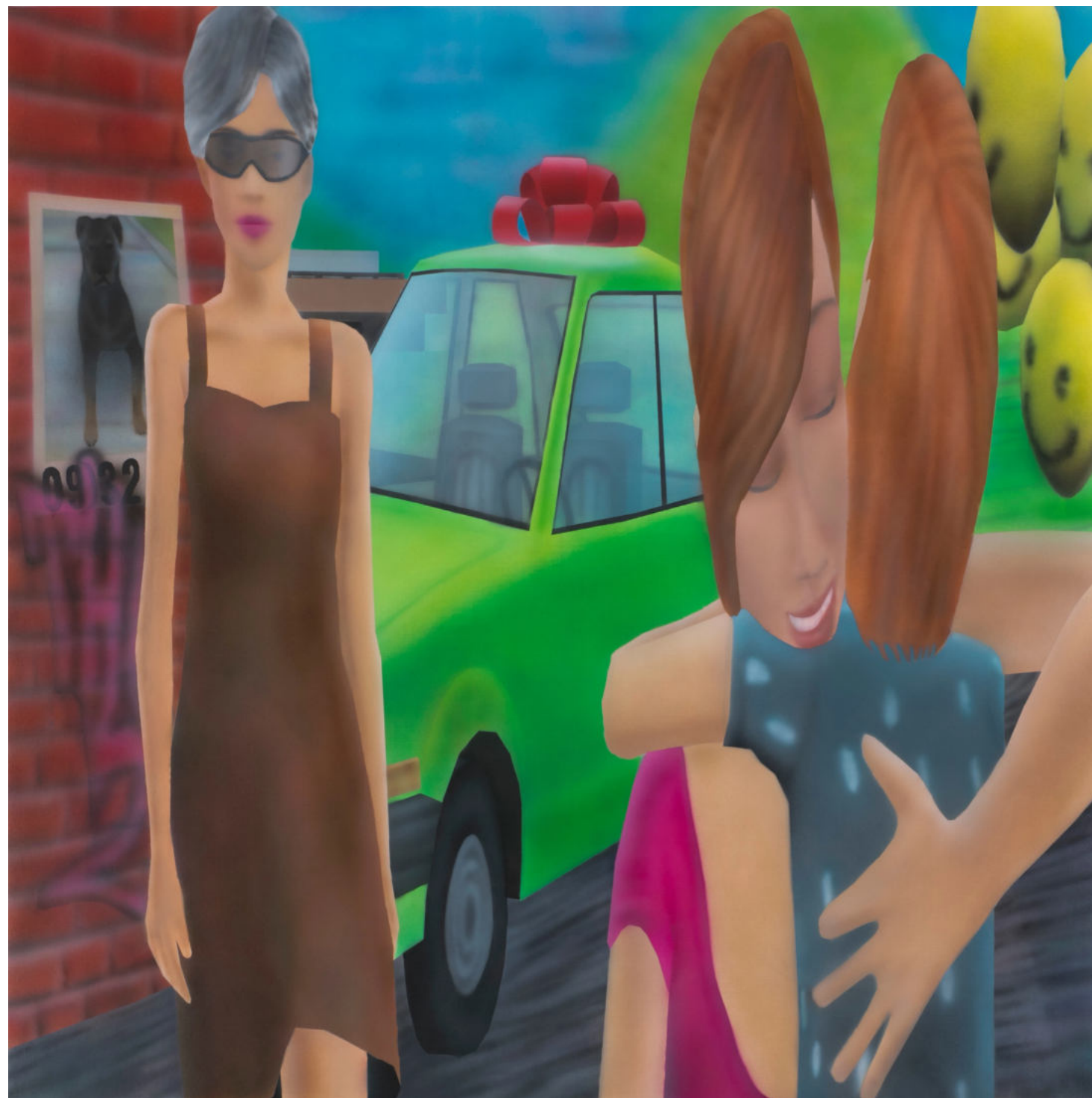
Composition 1, 2023