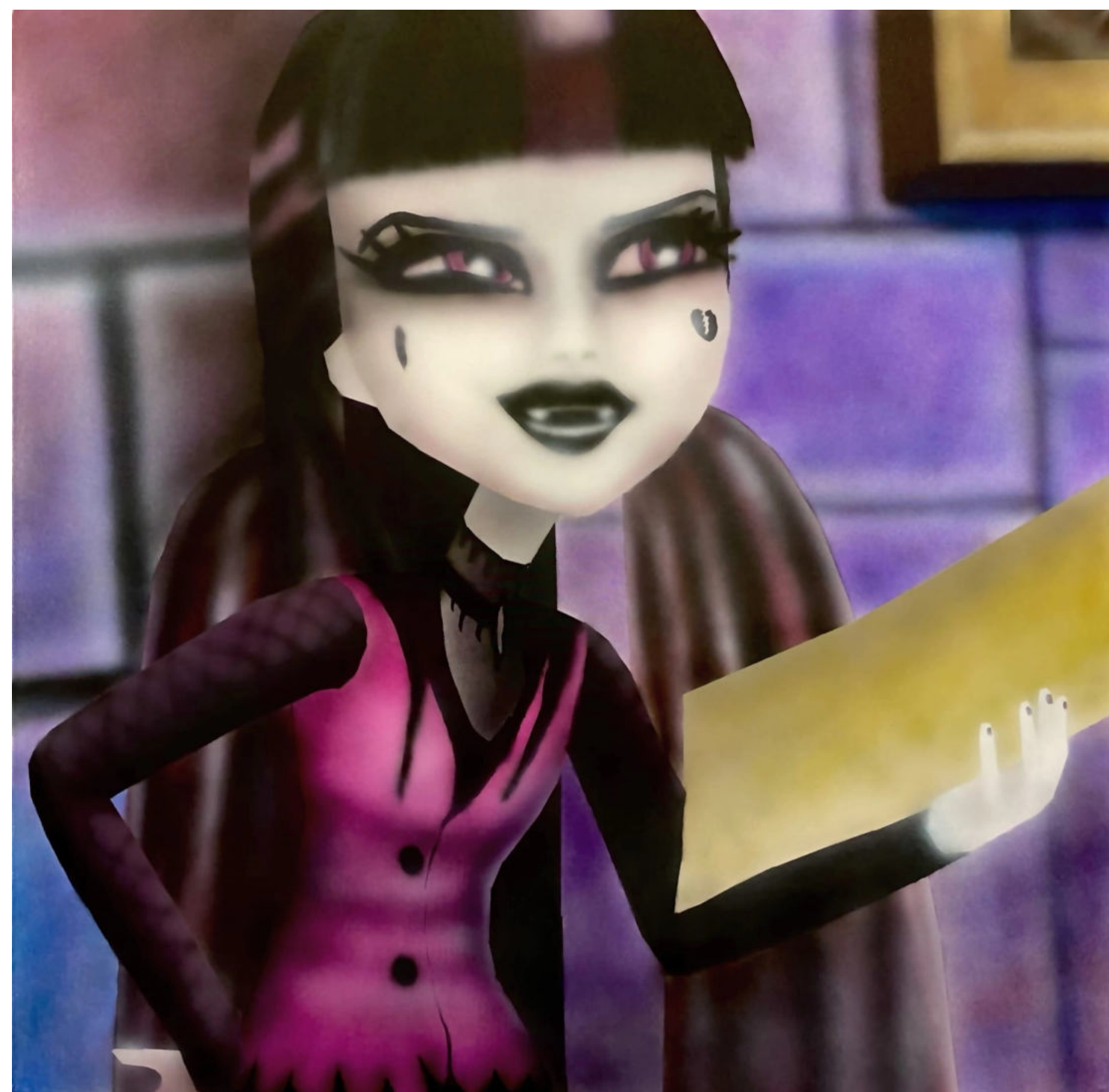
monster high, 2022