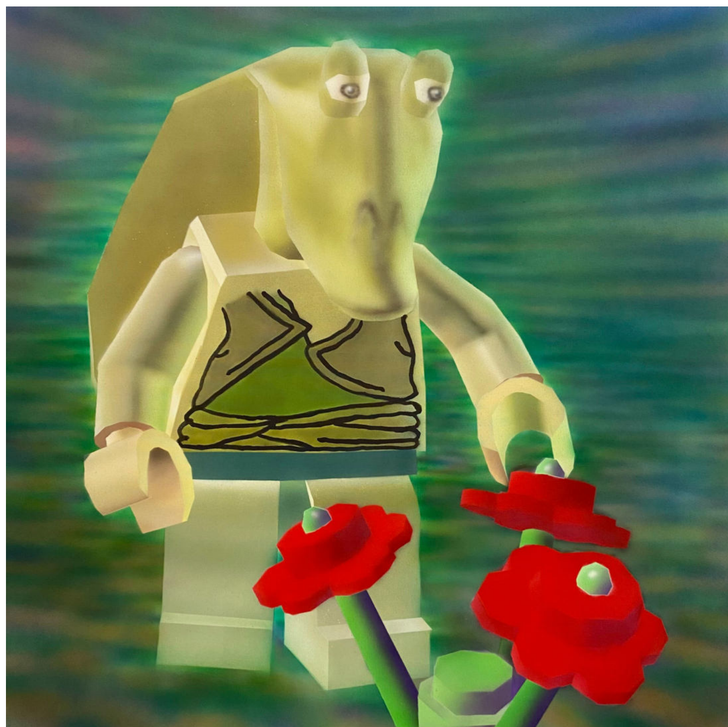
jar jar binks lego, 2022