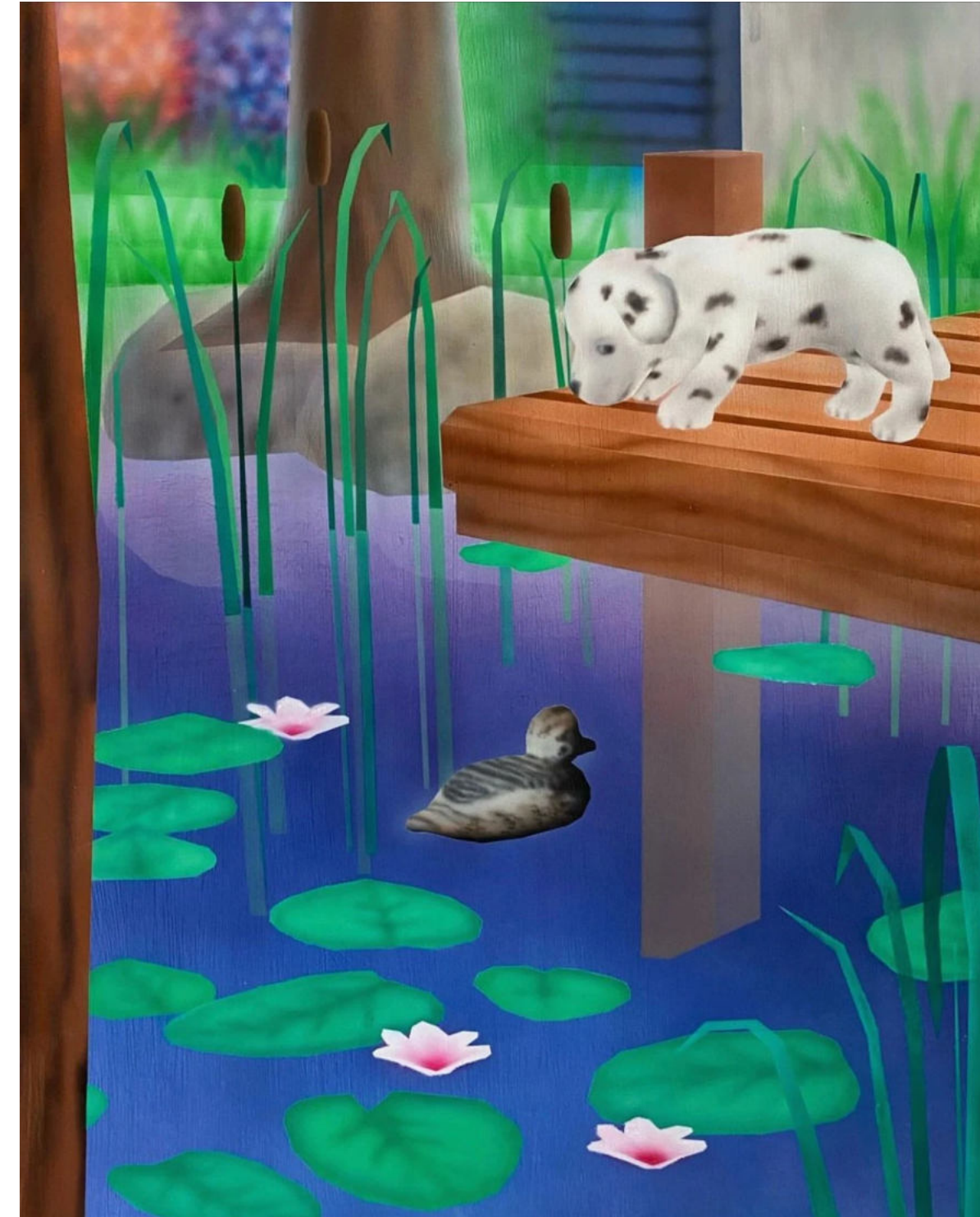
Puppy and duck, 2022