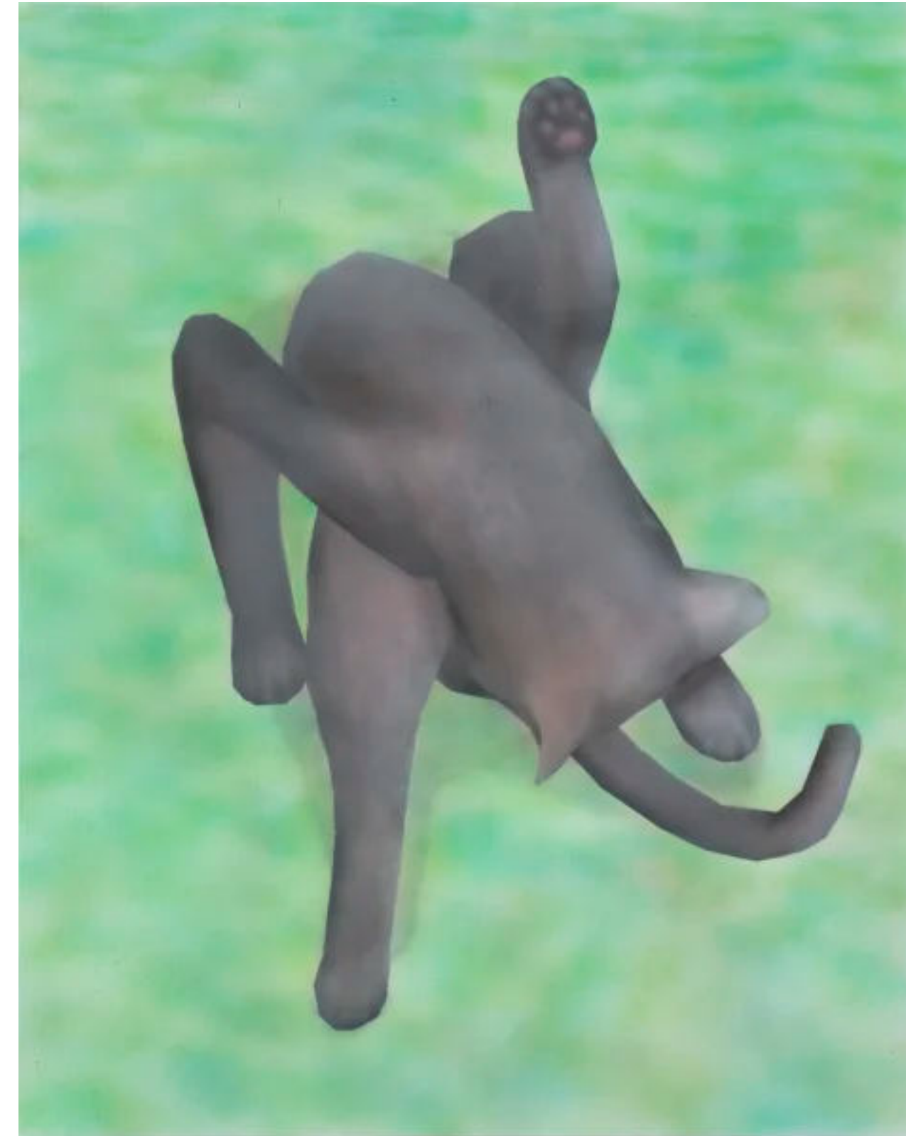
The cat , 2022 Acrylic on canvas 80 x 100 cm