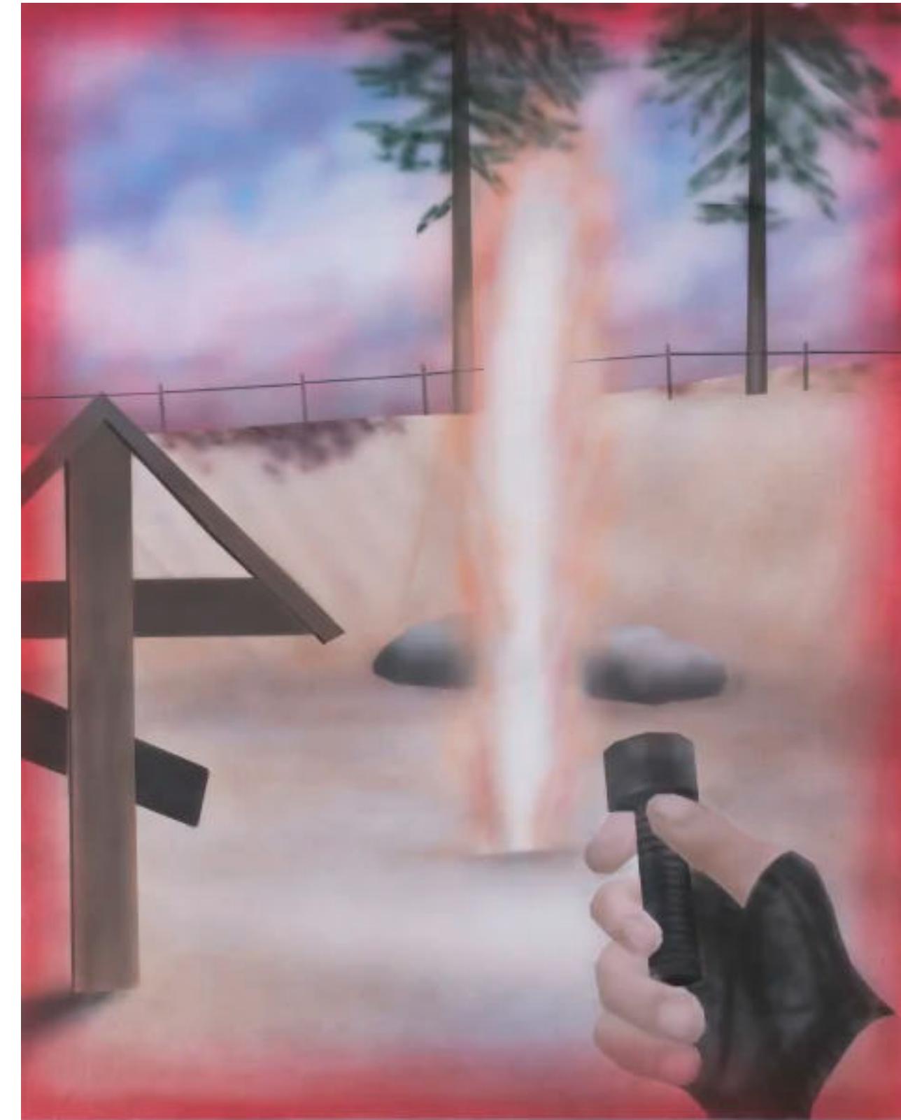
Anomaly , 2022 Acrylic aerosol spray paint on canvas 80 x 100 cm