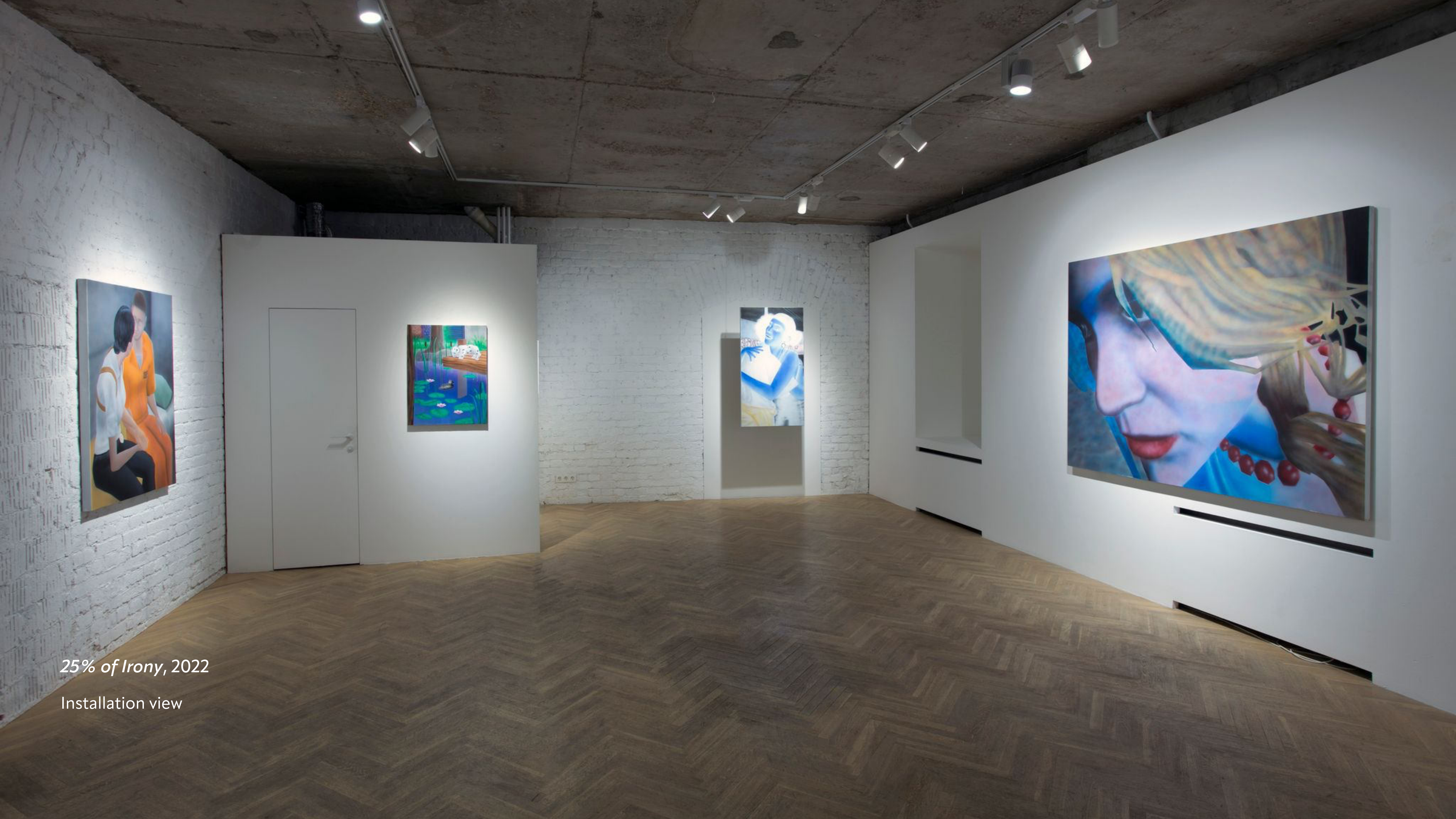
25% of Irony, 2022