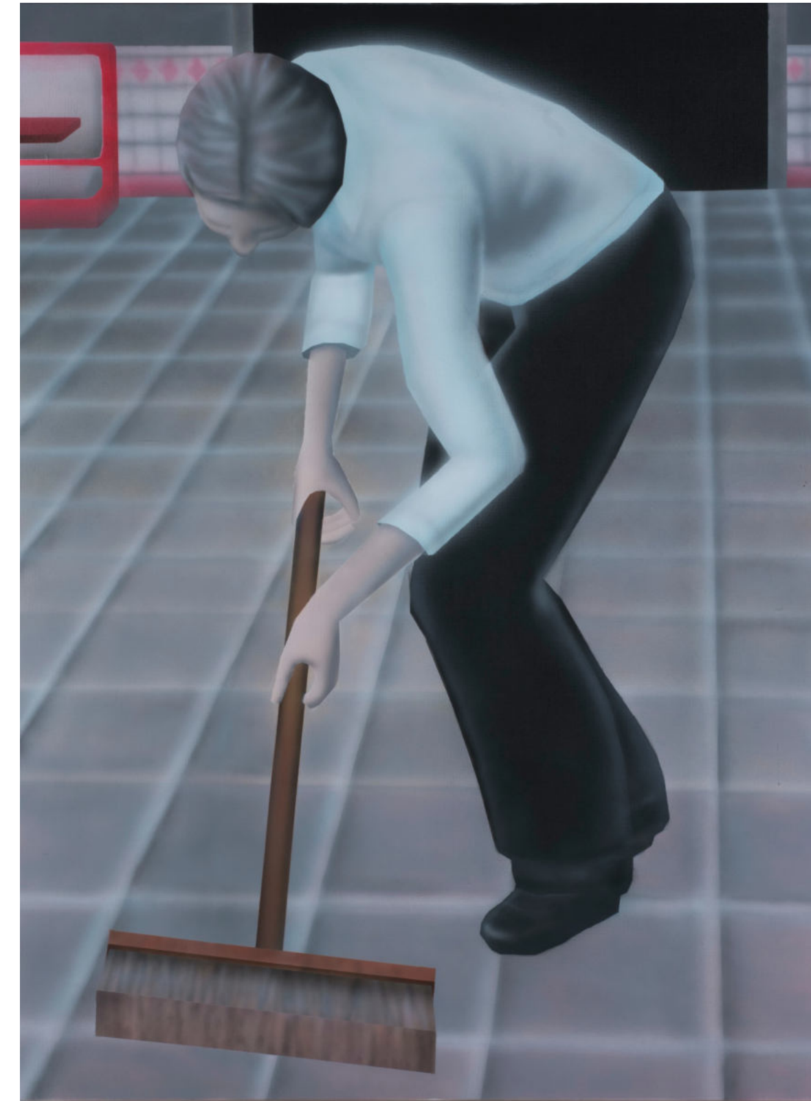
Cleaner, 2022 Acrylic on canvas 120 x 100 cm