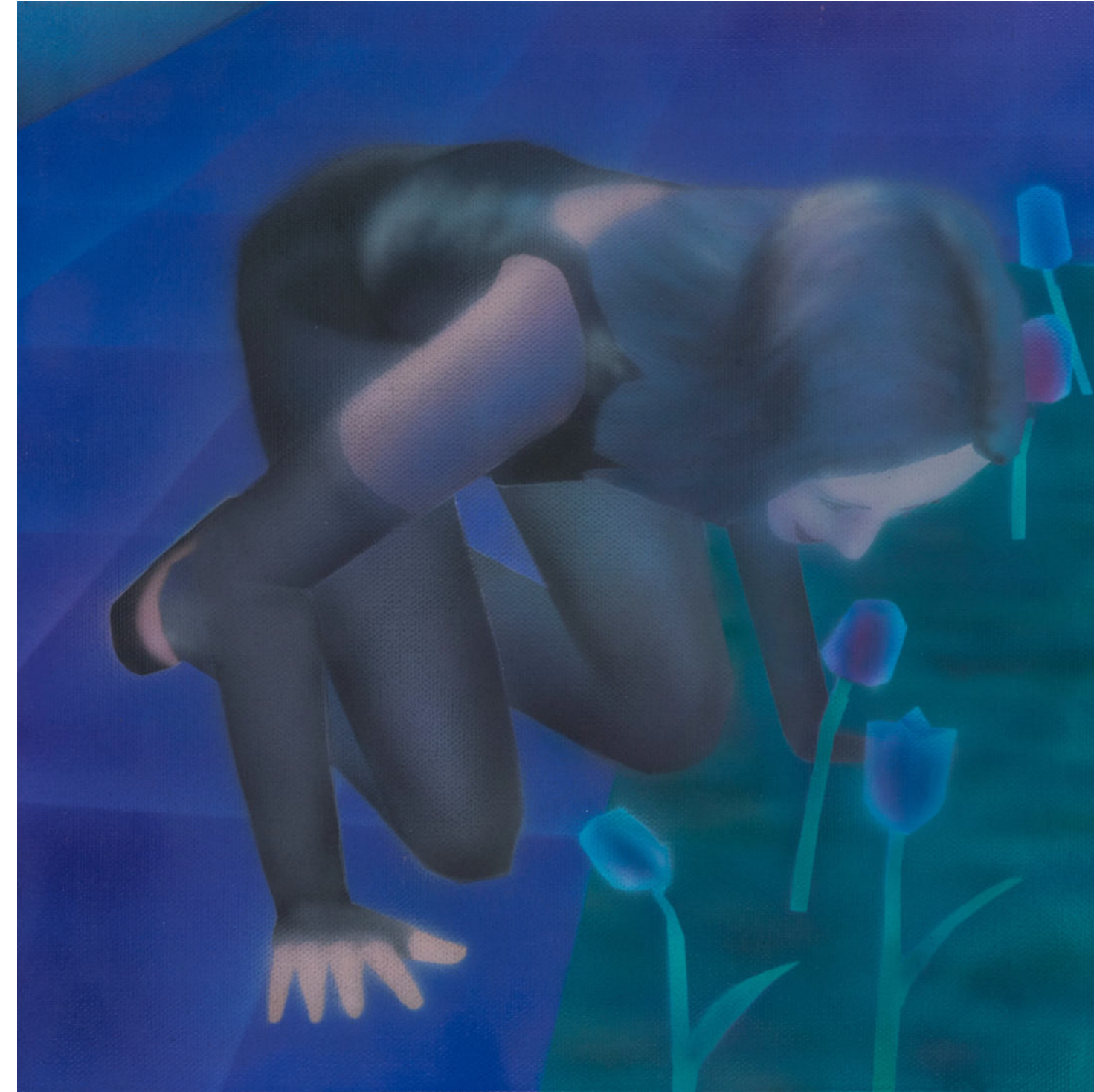
Flower sniffing at night, 2023