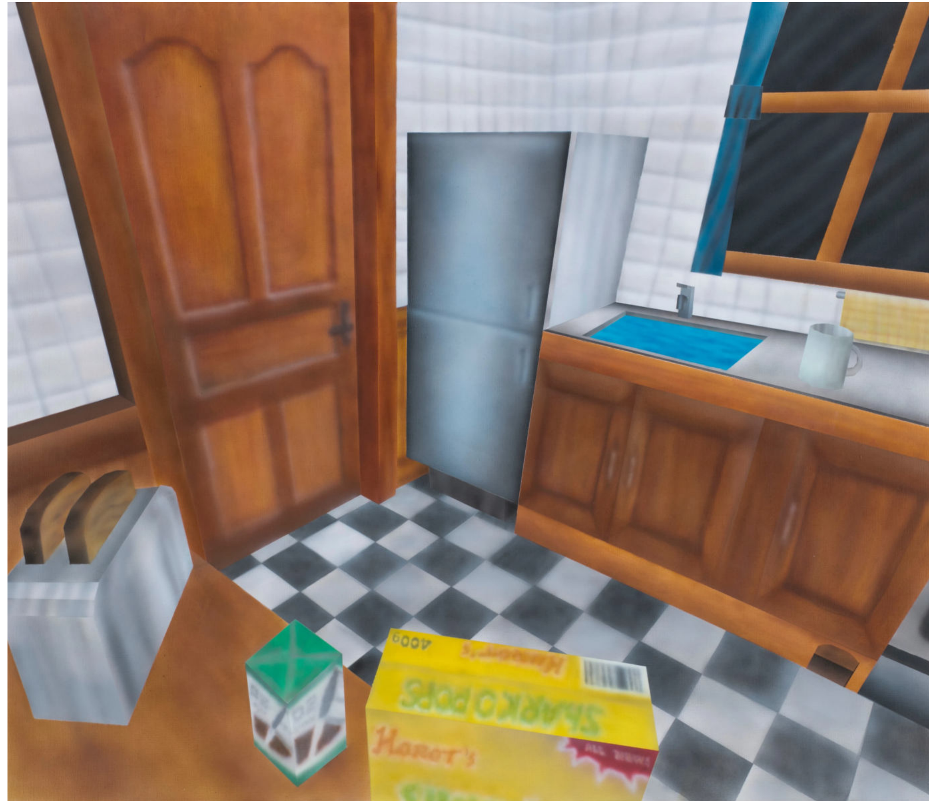
cs_rats1 , 2022 Acrylic on canvas 120 x 140 cm