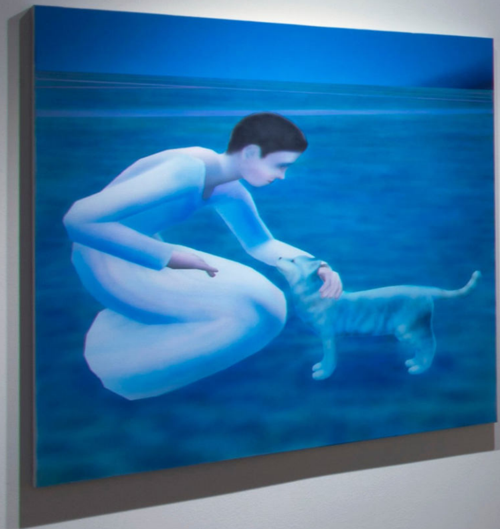
25% of Irony, 2022