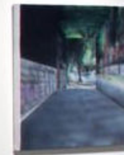
25% of Irony, 2022