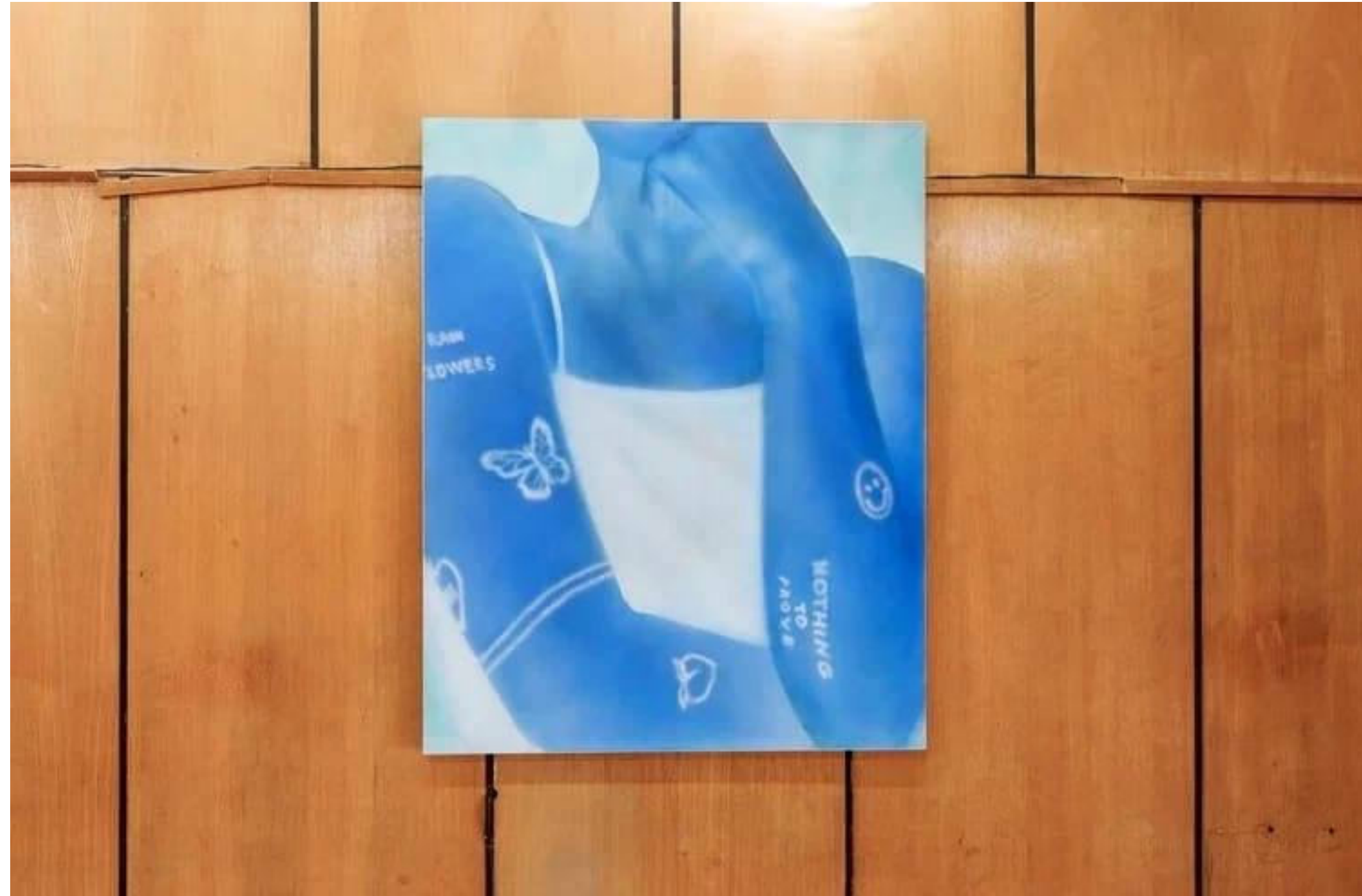
Tumblr girl , Moscow, 2021