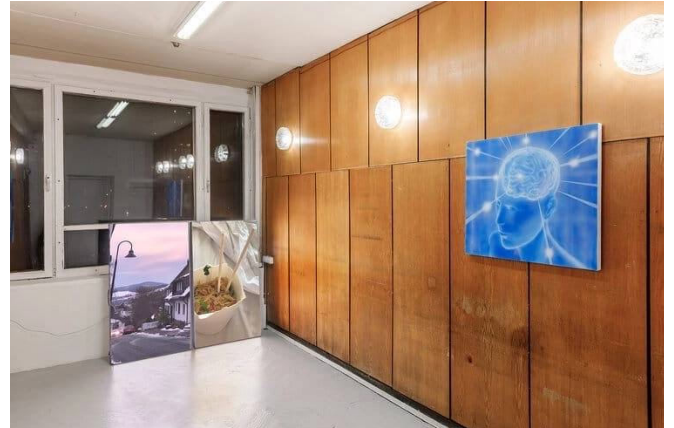
IP Vinogradov installation view